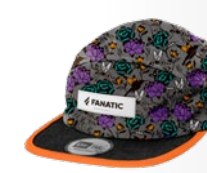
CAMPER CAP MOSQUITO 13210-5810 MULTI COLOUR S/M, M/L