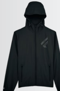
WINDBREAKER JACKET MEN 13212-5400 BLACK 48/S - 54/XL