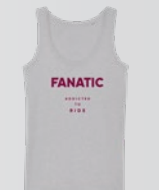
GIRLS TANK FANATIC 13203-5008 CREAM HEATHER GREY 36/S-40/L