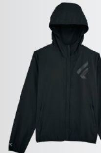
WINDBREAKER JACKET WOMEN 13213-5401 BLACK 36/S - 40/L