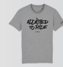
TEE SS ADDICTED 13212-5020 HEATHER GRAY 48/S - 56/XXL