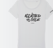
GIRLS TEE SS ADDICTED 13213-5025 FA WHITE 36/S-40/L