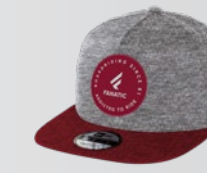
CAP BOARDRIDING 13210-5812 GREY/BURGUNDY S/M, M/L