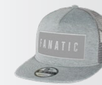
NET CAP FANATIC 13210-5811 HEATHER GREY S/M, M/L