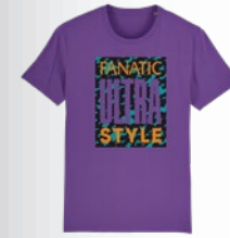
TEE SS ULTRA STYLE 13210-5023 LILAC 46/XS - 56/XXL