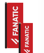
FLAG VERTICAL 13200-8543 220 x 80 CM, 160 x 60 CM