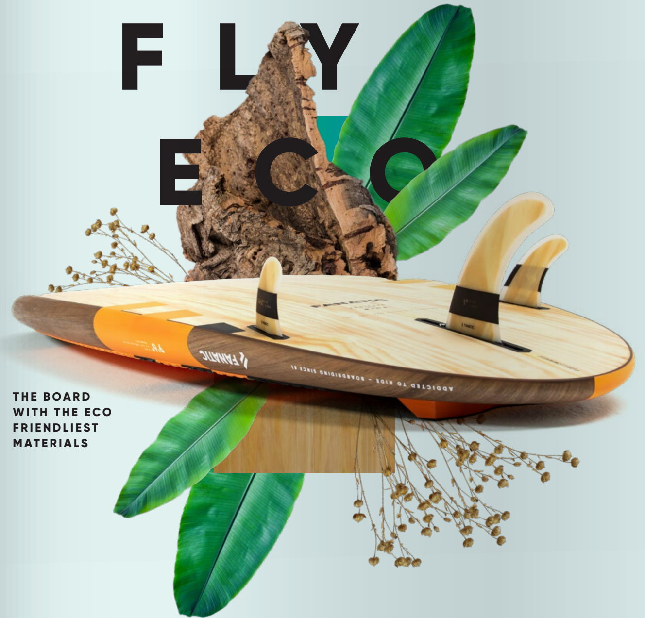
THE BOARD WITH THE ECO FRIENDLIEST MATERIALS

FIND OUT WHAT WE'RE DOING TO PROTECT WHAT WE LOVE. FANATIC.COM/SUP/OUR-WORLD/ABOUT-US/SUSTAINABILITY