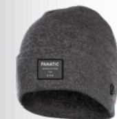
BEANIE ADDICTED 13200-5810 DARK GREY ONE SIZE