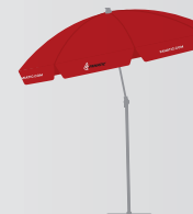
BEACH UMBRELLA 13800-8521 BEACH UMBRELLA STAND 13800-8522