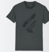
TEE SS F LOGO 13212-5022 ANTHRACITE 48/S - 56/XXL