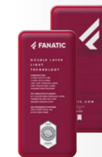
DROP STITCH SAMPLE 13200-8557 DOUBLE LAYER LIGHT