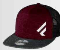
CAP FANATIC 13200-5812 BURGUNDY S/M, M/L