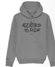
HOODIE ADDICTED 13210-5226 MID HEATHER GREY 46/XS - 56/XXL