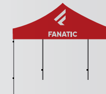
FOLDING TENT FRAME (PART 1) 13200-8552 300 x 300 CM