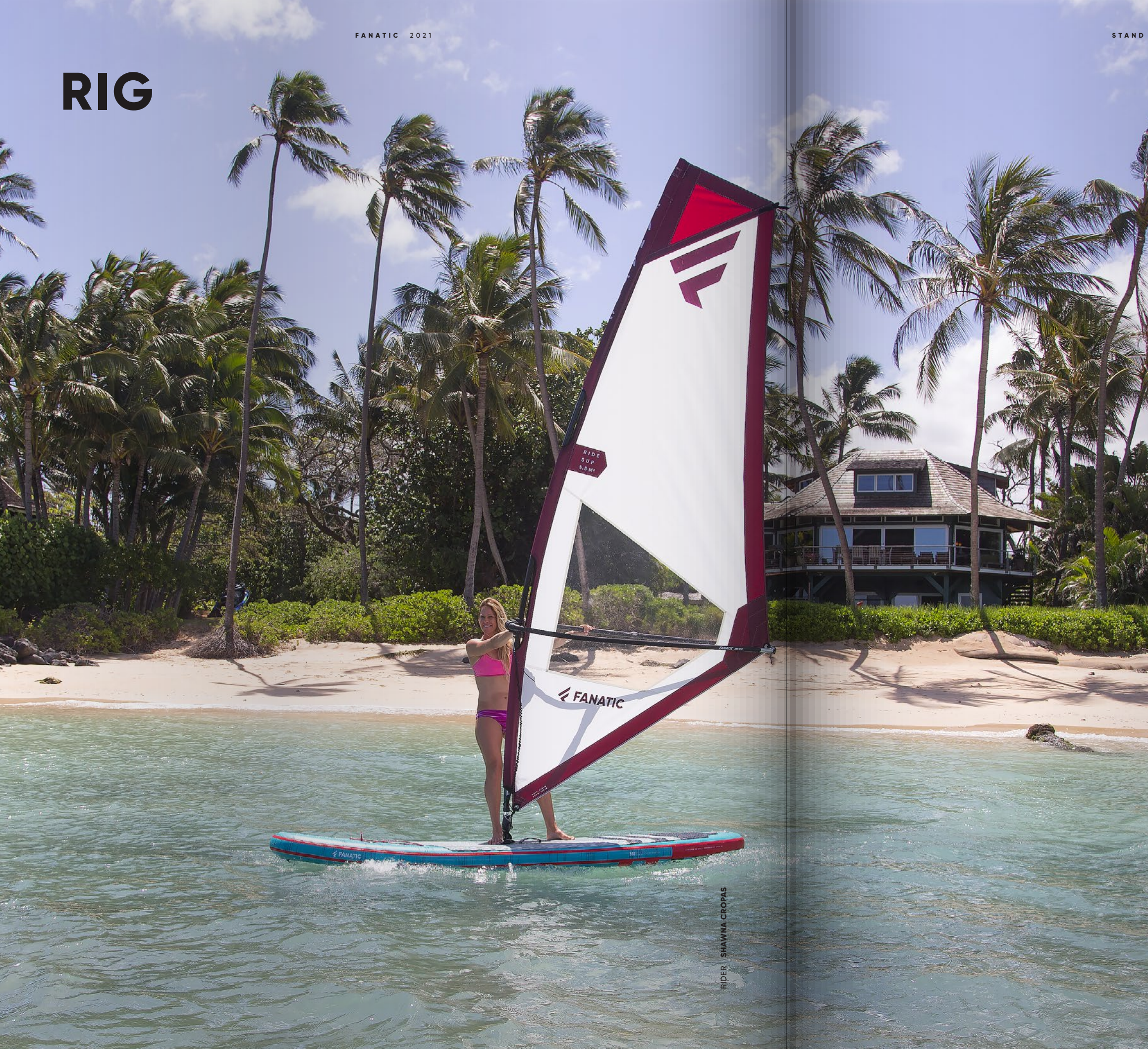
RIDER: SHAWNA CROPAS