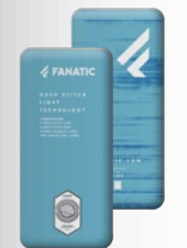
DROP STITCH SAMPLE 13200-8557 DROP STITCH LIGHT