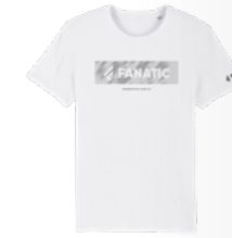
TEE SS FANATIC LOGO 13212-5021 WHITE 48/S - 56/XXL