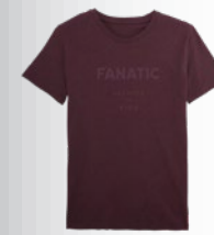
T-SHIRT FANATIC 13202-5023 HEATHER GRAPE RED 48/S - 56/XXL