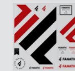
LOGO STICKER SET 2.0 13200-8200 MIXED DIN A5