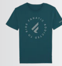
T-SHIRT ADDICTED 13202-5020 STARGAZER 48/S - 56/XXL