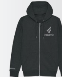
ZIPPED HOODIE FANATIC 13200-5225 DARK HEATHER GREY 46/XS - 56/XXL