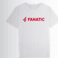
KIDS SHIRT FANATIC 13200-5228 WHITE 5-6, 7-8, 9-11, 12-14