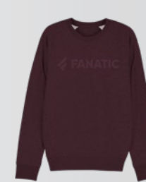
SWEATER FANATIC 13200-5227 HEATHER GRAPE RED 48/S - 56/XXL