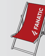
BEACH CHAIR 13200-8546